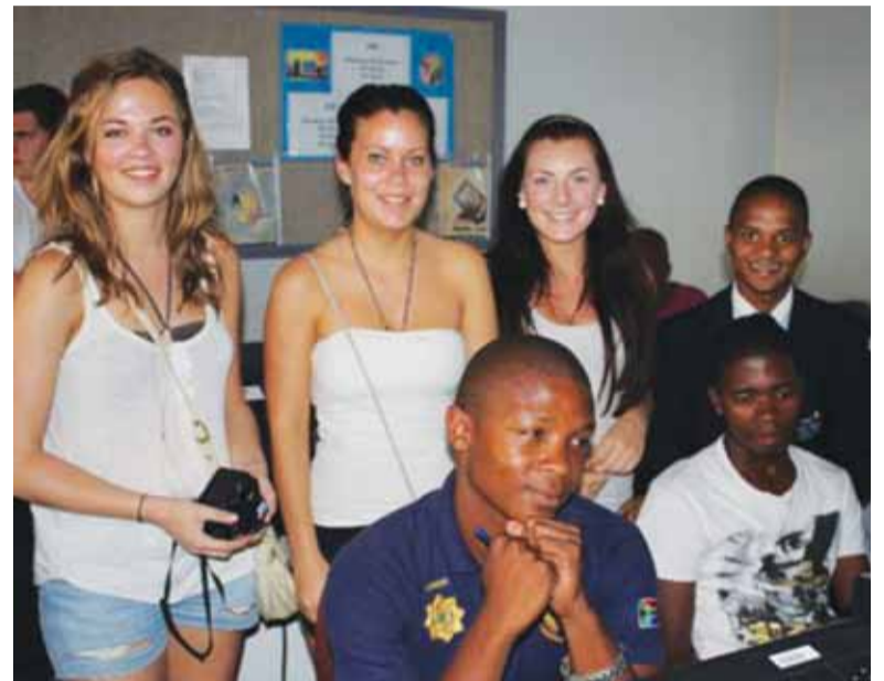
Norwegian tutors and students chatting to their Boland College counterparts. The Norwegians visited several of Boland College's campuses in February of this year.

Their visit here was, however, not all about work and relevant matters as they also found time to visit several tourist attractions in the Western Cape such as Table Mountain, the V&A Waterfront in Cape Town,