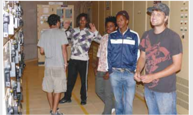
Strand Campus Engineering students pictured here while on their visit to the Palmiet plant. They much enjoyed a thorough tour of the entire facility, more than 20 storeys underground.