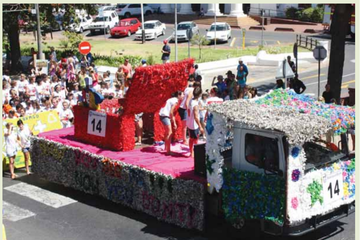
Kolonieshof (Boland College male hostel) teaming up with the ISA Carstens Health and Wellness Academy for Maties Rag in aid of Maties Community Service.

of the highlights to which thousands of people flocked to watch the students act their hearts out for this good cause. Kolonieshof (male residence on BC's Stellenbosch Campus) won